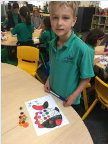
Making 3D shapes in Maths