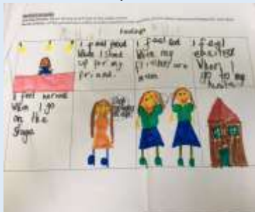
Milly C - Writing

Here is a snapshot of our learning this week: