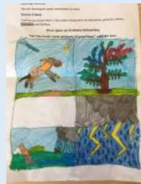
Mabel - Reading