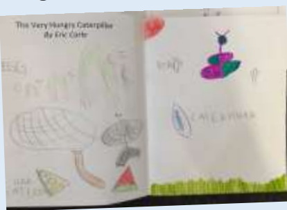
Bea - Writing