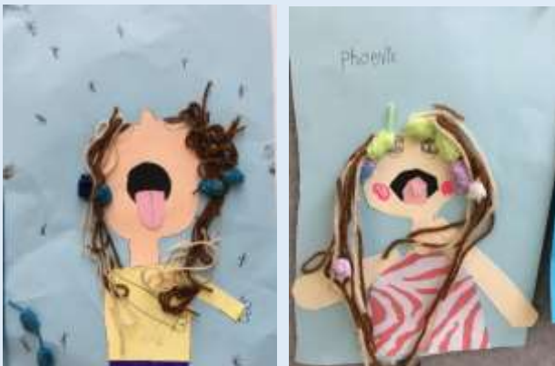
Phoenix and Mae - 'How to catch a snowflake craft activity'.