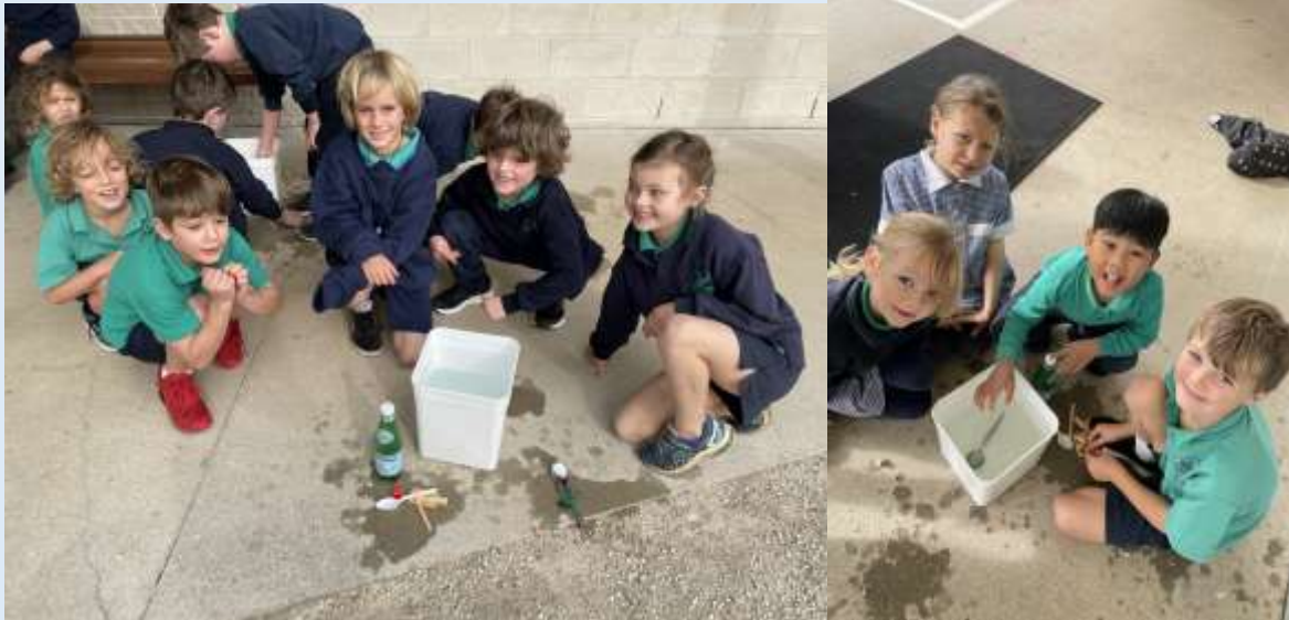
Students in Junior J investigating forces in water

Students investigated how forces work in water. After learning about how forces work in water, students predicted then investigated which items (empty water bottle, paddle pop stick, metal spoon, plastic spoon, a coin) would float or sink. Students then came up with a definition for how forces work in water.