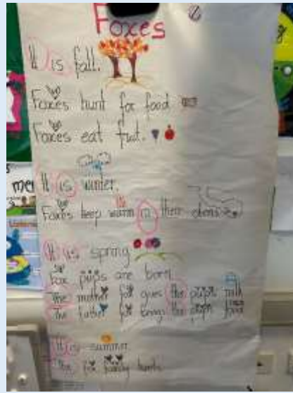
Class Work finding sight words