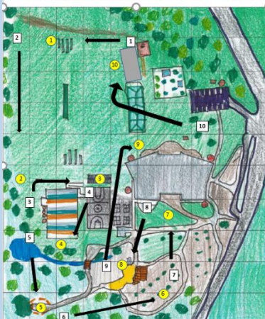
The Royal Anglesea Primary School Frisbee-Golf Club

This week in Maths we were looking at negative numbers and the importance that they have in everyday life. As an end of term activity, we set up a frisbee golf course consisting of 10 holes, each hole was provided with an appropriate par for the players to attain (and hopefully score below). Each student was provided with a map of the course and set off to play their round. There was a vast variety of scores that came in at the end with students scoring anywhere from -17 to +50. We created a table of our results and a ranking system for the students to observe the fluctuation in results. This was a fun way for the students to finish off a great term of Maths learning that has happened within the space.