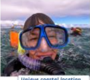
Unique coastal location