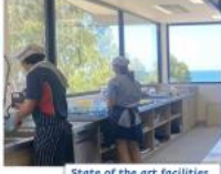
State of the art facilities

Address: Lorne P-12 College Grove Road Lorne VIC 3232