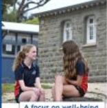
A focus on well-being

Enrolment packs will be available on the night.