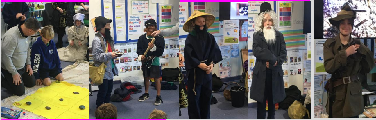
History Box "Gold" and "Eureka to Federation"