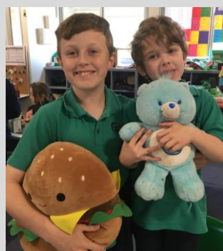
Teddy Bear's Picnic with our buddies Decorating teddy bear biscuits with icing.